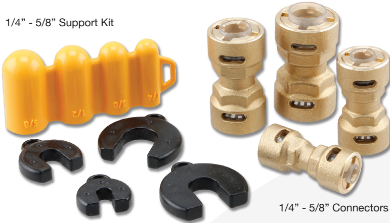
1/4" - 5/8" Connectors