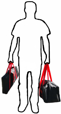
Completely Portable CM 340 = 2 carry bags CM 520 = 2 wheels + handle