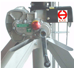
Manual operation with handle

4 telescoping legs for unneven ground and Operation in confined space. Special design to work close to the wall