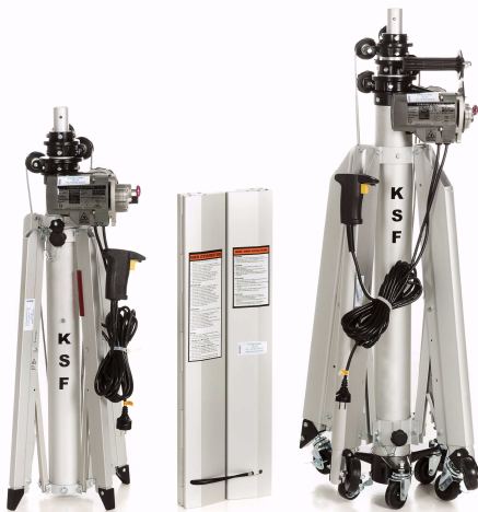
CM 520 equipped with wheels, option for CM 340